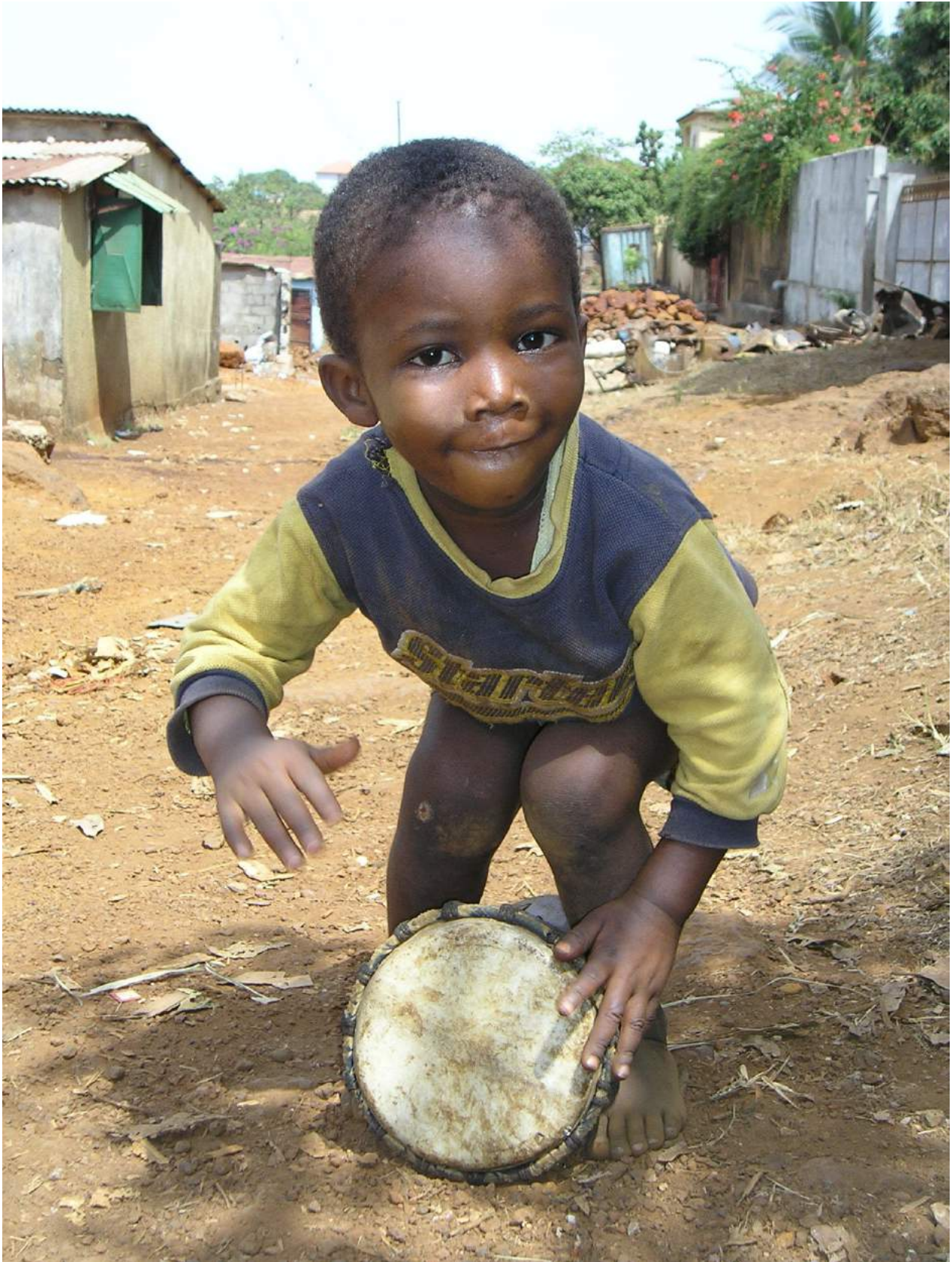
Guinea - February 2007

You're never too young to start playing music! :)